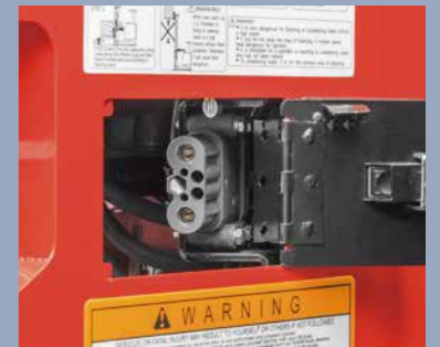
Charging plug inside operator's compartment, this eliminates the need to disconnect the plug from battery, enhancing ease of operation (Std)