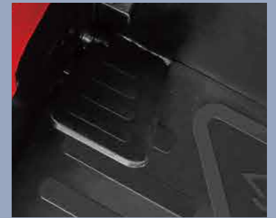
Safe pedal: when the pedal is released, traveling is stopped, and only hydraulic operation is enabled