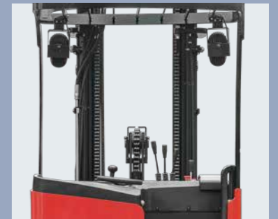
New designed mast and the large open steel roof provide super visibility and safety