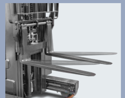
Forks can tilt forward/backward for easy loading